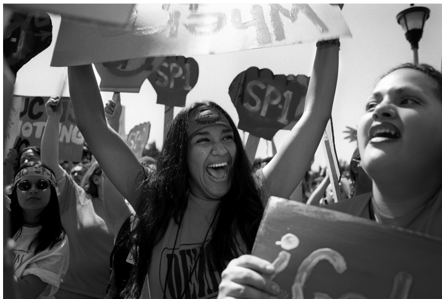
FIGURE 6. A Riverside student celebrates the Regents' decision to rescind SP-1. Los Angeles Times , May 17, 2001, p. B-1.

confirming a fall 2002 implementation date for comprehensive review—but only if the Academic Senate recommended it and the Regents approved it. 5