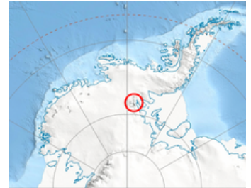
Location of Sentinel Range in Western Antarctica.

This article incorporates public domain material from the United States Geological Survey document "Mount Atkinson" ( https://geonames.usgs.gov/apex/f?p=gnispq:5:::NO::P5_ANTAR_ID:696 ) (content from the Geographic Names Information System ).