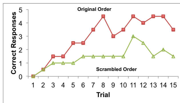
Fig. 1 Memory after 67 Years. Correct anticipations across 15 learning trials for words presented in the original order (closed red squares) and words presented in a scrambled order (open green triangles). Responses are averaged over 2 days of learning, across which order condition was counterbalanced. (Color figure online)

Figure 1 illustrates the number of correct anticipations made for the half of the list presented in the original order (closed red squares) and for the half of the list presented in scrambled order as a function of the learning trial (open green triangles). The first cycle through the list was