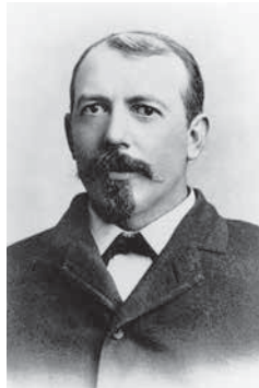
Edward Wyllis Scripps, ca. 1890.