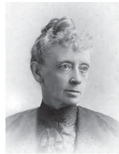
Ellen Browning Scripps, ca. 1891.

In 1903, the Marine Biological Association of San Diego was officially established in the Hotel Del Coronado boathouse, where today its beginnings are on exhibit. Two years later, Ritter and his team moved into “the little green laboratory” at La Jolla Cove. In 1907, they purchased the institution’s current site on what is now the lower campus. E.W. Scripps and Ellen Browning Scripps arranged for the transfer of the La Jolla land. Miss Scripps provided a substantial gift to fund the first building, and she asked architect Irving Gill to design a reinforced concrete structure.