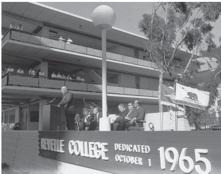
UCSD's first undergraduate college, Revelle College, was founded in 1965 and named in honor of the chief architect of the university.

At a Regents meeting in November 1960, President Kerr recommended that the name of the campus be changed from the “University of California at La Jolla” to the “University of California at San Diego,” which was approved. The date of the Regents’ action was November 18, 1960. In the early 1980s the decision was made to designate that date as the official “Founders Day” for UCSD. We had a wonderful twenty-fifth Anniversary Celebration on that date in 1985, and in 2010 the campus celebrated its fiftieth Anniversary year. 6