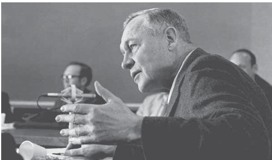
Roger Revelle testifying in favor of establishing the University of California at San Diego in 1960.

While Roger moved forward with the school as originally planned, there was much debate around the state about whether three new campuses should be created. At this point, in 1958, President Sproul ended his twenty-eight year tenure. Having taken the university through the Great Depression and World War II, he was regarded as one of the nation's leaders of higher education. The man who replaced him was Clark Kerr (1911-2003), first chancellor of UC Berkeley, who proved to be a great leader during a very difficult and critical period.