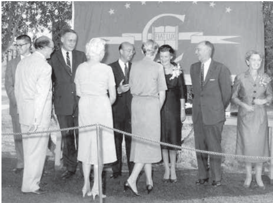
Clark Kerr's inauguration as president of the University of California, October 6, 1958. Roger Revelle is third from left.

In 1957, Sproul placed the proposal before the Regents of the University of California at a meeting and it was approved. Revelle was named dean and given authority to begin recruiting faculty (I might add that he was recruiting faculty long before he had the authority and often would pay them using federal research funds, promising that when the school was officially established, they would receive their appropriate academic appointments). At the last moment of the Regents’ meeting, Sproul announced that he did not believe the name “School of Science and Engineering” was appropriate and recommended that it be called the “University of California at La Jolla.” The Regents agreed.