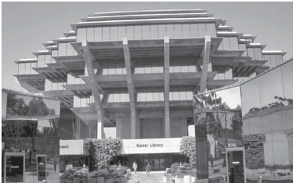
The Geisel Library (1970), designed by William Pereira & Associates, remains a distinctive feature of UCSD’s campus.