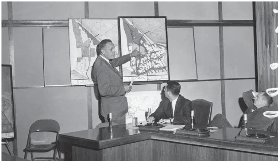
Scientist and scholar Roger Revelle fought for the establishment of a University of California campus in San Diego.