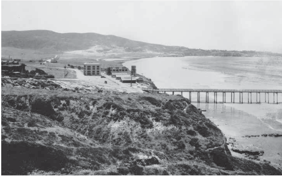
By the 1920s, SIO had a laboratory, a public aquarium, a pier, a library and museum building, and nearly two dozen cottages where faculty and staff lived and worked.

That building, the George H. Scripps Laboratory (1910), is still there today.