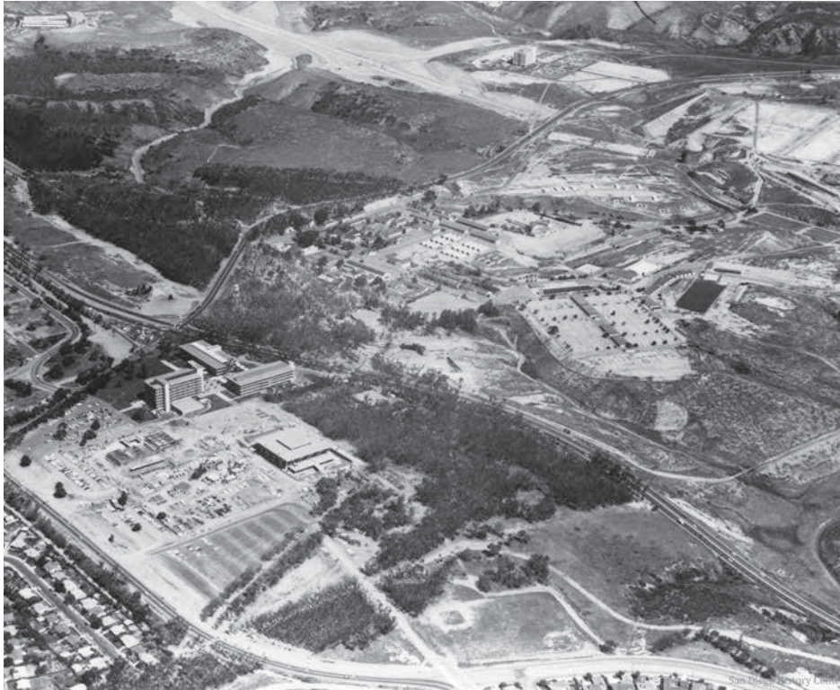
In 1960, the University of California approved the construction of the new campus. The first undergraduates arrived in 1964.