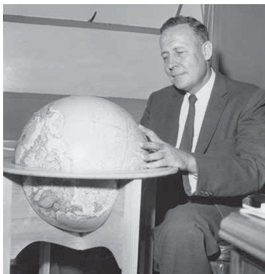
Dr. Roger Revelle, 1957.

Shortly before Pearl Harbor, two critical events occurred. First, Revelle was called to active duty and assigned to the U.S. Navy Radio and Sound Laboratory in San Diego. 3 About the same time, Robert Gordon Sproul (1891-1975), President of the University of California, announced that the cyclotron at Berkeley and other university laboratories, including